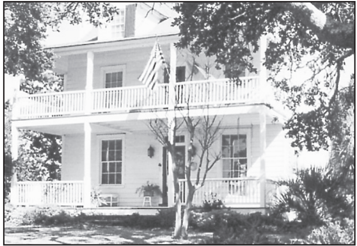
(Photo of the Hammock House)

Another idea brought from tropical climates was the use of long, narrow rooms that extend from the front to the back and allow sea breezes to cool the entire house. Two levels of outdoor living allowed residents to catch the incoming breezes from both the upstairs and downstairs. The “double porches” on many of Beaufort’s historic homes also helped keep residents cool in warm weather.