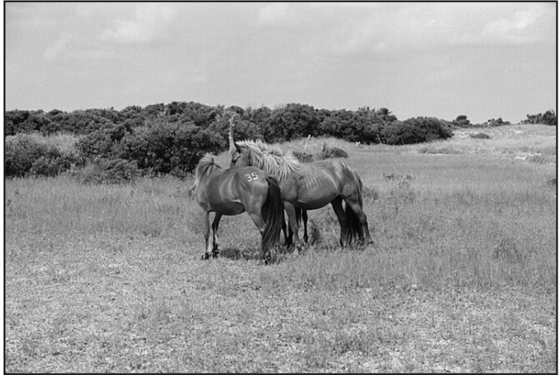
(Photo of wild horses of Shackleford Island )

According to legend, the wild horses that live on the island survived Spanish shipwrecks in the 1500s. When the island's settlers needed horses for farm work, they caught and used the animals to pull plows and wagons. Settlers released the horses into the wild, when their work was done. Today, 100 horses roam the island, but no person lives there. Federal law protects the herd.