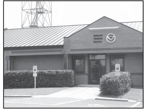
(Photo of the National Weather Service in Newport, courtesy of the Carteret County News-Times )

Today, hurricanes and tropical storms can be predicted and their paths tracked to help residents prepare for a weather emergency. Using the latest in radar, satellite and computer equipment, weather experts at the National Weather Service, located in Raleigh, Wilmington and Newport, constantly watch the areas' weather conditions and issue weather warnings to counties in central and eastern North Carolina. Other weather stations serve western North Carolina.